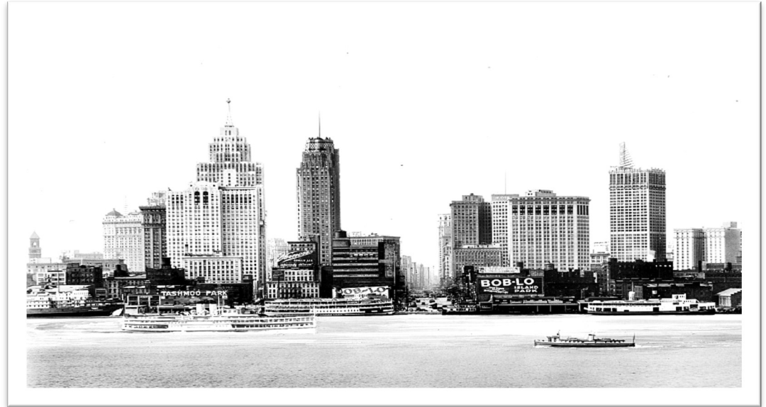
Detroit, c. 1910-1930.

Check urbanhistory.org/Detroit2020 for updates.